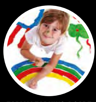
EARLY LEARNING & CARE

email: info.office@mcegan.ie Tel: 026 41076 www.mcegan.ie